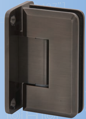
Product Code H-MBGTW-FP Wall Mount with Full Back Plate