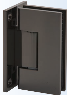
Product Code H-MGTW-FP Wall Mount with Full Back Plate