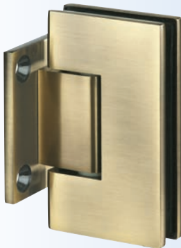
Product Code H-MGTW Wall Mount with Short Back Plate