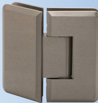
Product Code H-MB135GTG 135° Glass-to-Glass