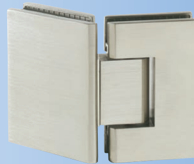
Product Code H-M135GTG 135° Glass-to-Glass