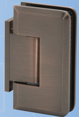
Product Code H-MBGTW-OP Wall Mount with Offset Back Plate

Note: Complete the above product codes by adding the desired finish code to the end.