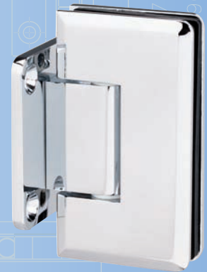
Product Code H-MBGTW Wall Mount with Short Back Plate