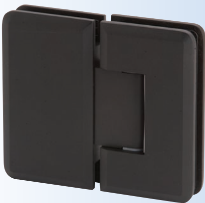
Product Code H-MB180GTG 180° Glass-to-Glass