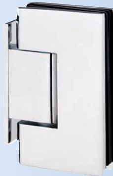
Product Code H-MGTW-OP Wall Mount with Offset Back Plate